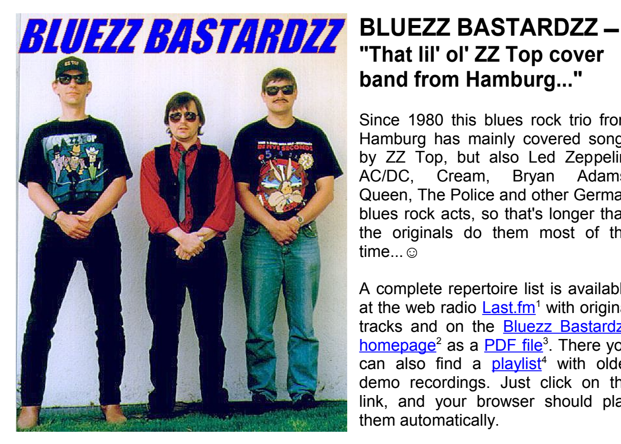
"Arrested for driving while blind in 1998."