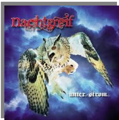
Unter Strom (Under Power) (7us 2014) D7-007-2