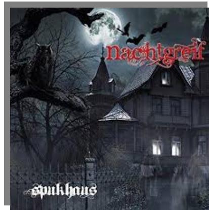
Spukhaus (Haunted house) (RecordJet 2018) NG2018