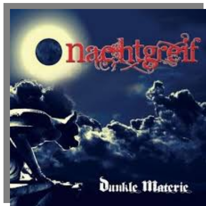
Dunkle Materie (Dark Matter) (7us 2017) 7H-246-2