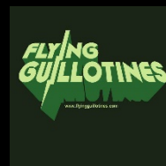
MONSTER EP 2017