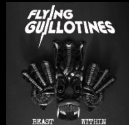
BREAK MY BONES EP 2018