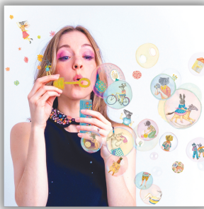
Playroom on Spotify

Süddeutsche Zeitung Band der Woche 8. November 2021