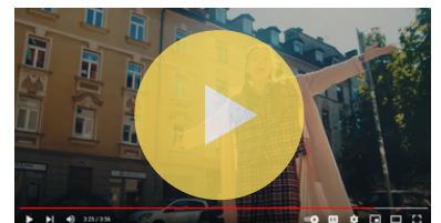
"I'm Awake" Official Music Video